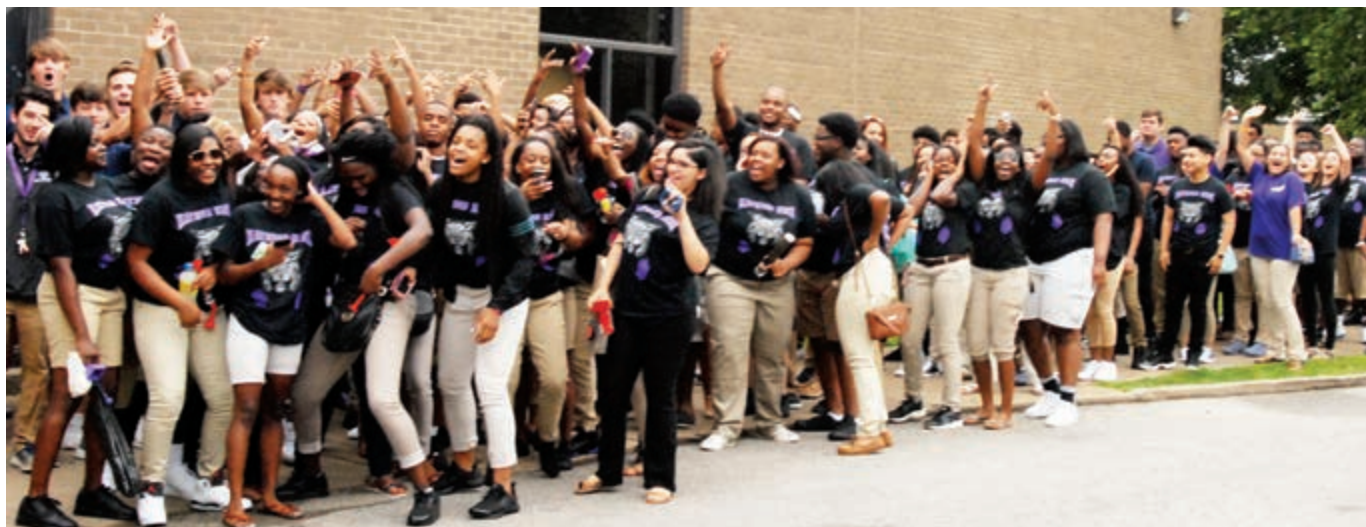
The Class of 2018 made a grand entrance into Haywood High School this year on the first day of school. They have three more nine weeks before they walk down the aisle to receive their diplomas and begin their adult life after school.